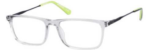
sdo.peterson - 108 grey / fluoro yellow

The tip acetate will be black out/fluoro yellow crystal in in production.