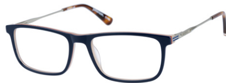
sdo.peterson - 106 navy / tort

The temple will be dark grey in production, without green hue.