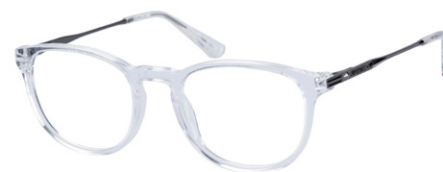
sdo.olson - 113 crystal / gun