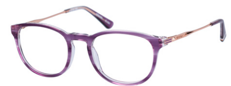
sdo.olson - 151 dazed lilac horn