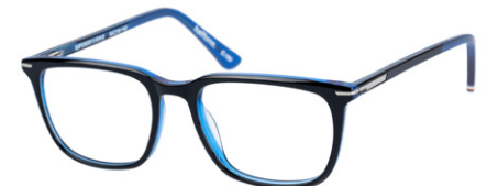
sdo.halftone - 189 black / royal blue