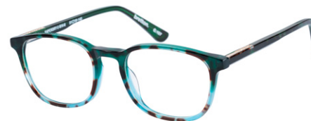
sdo.bretton - 107 teal tort

Metal logo trim will be matt gold in production