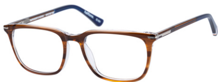
sdo.halftone - 101 horn / french navy