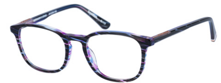
sdo.bretton - 117 black / purple stripe