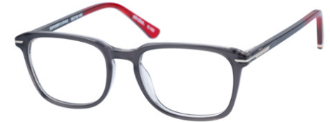
sdo.strobe - 108 grey / red