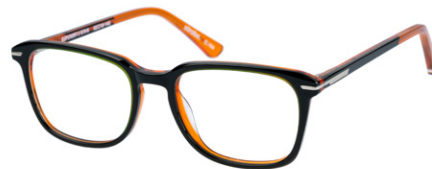
sdo.strobe - 104 black / green