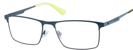
sdo.caleb - 004 black / oregon green