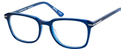
sdo.strobe - 106 navy / royal blue