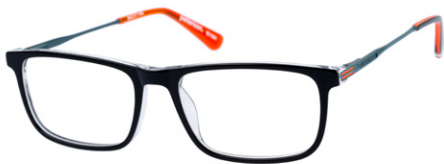
sdo.peterson - 104 black / orange

The temple will be dark grey in production, without green hue.