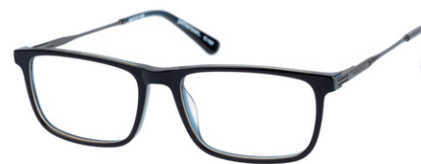
sdo.peterson - 107 black / oregon green

The front will be gloss navy out/ tort in in production.