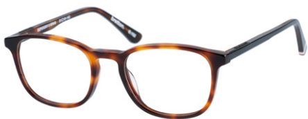
sdo.bretton - 102 tort / black