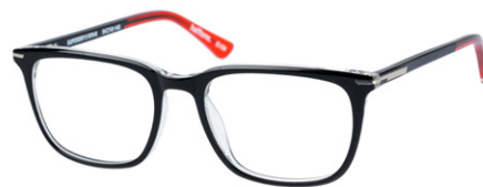
sdo.halftone - 104 black / orange

The temple acetate will be 1st part black, 2nd part orange as SDO Strobe 104 temple in production.