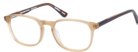
sdo.bretton - 103 nude / gold

Metal logo trim will be matt gold in production