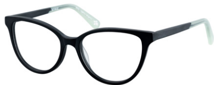
BIO - 1005 - 104 Matte black / Mint