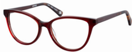
BIO - 1005 - 160 🍷 Gloss red / Red tort