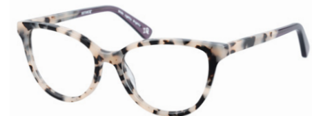
BIO - 1005 - 170 Gloss white tort / Purple